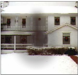
Vision in dry type

Macular degeneration is associated with aging, and it affects more than 10 million Americans including one in three people over the age of 75. Macular degeneration causes a loss of function of the portion of the retina used for central vision (the macula) for activities such as reading and driving. The macula is a highly specialized area of the retina which is 100 times more sensitive to detail than the rest of the retina and is responsible for color discrimination. Even in its most severe form, macular degeneration will not cause total blindness as it does not affect the peripheral (side) vision, so people can lead independent lives in familiar environments.