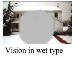
Vision in wet type

Macular degeneration has two basic forms: wet and dry. The dry form is much more common (approximately 90% of those with macular degeneration) and typically causes a gradual decrease in vision most noticeable when reading. It almost always occurs in both eyes, but may be worse in one eye. Once a patient has been diagnosed with dry macular degeneration, it