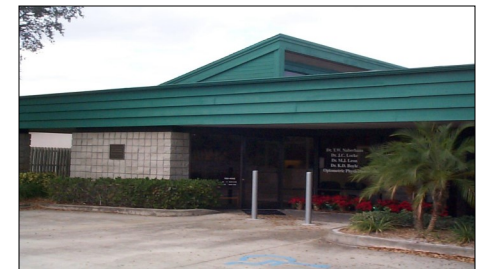
Melbourne Office 2420 S. Babcock St.

Most people have some degree of astigmatism; yet, it is a problem only if it significantly affects the ability to see well. Very often the effects of astigmatism will be noticed only at night. As the pupil of the eye enlarges in darkness, the effects of the irregular shape of the front of the eye are more prominent. When the pupil becomes small in bright light, the curvature effects of the cornea are minimized and the “pinhole effect” aids the visual acuity. The pinhole effect is the principle by which instamatic cameras give well-focused pictures at varying distances without a change of focus of the lens of the camera. Astigmatism has no age, race, or gender preferences, and tends to change over the years without any discernible pattern.